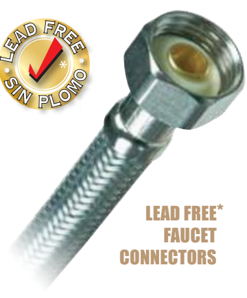
LEAD FREE* FAUCET CONNECTORS